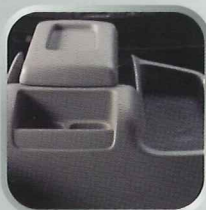
Centre console box