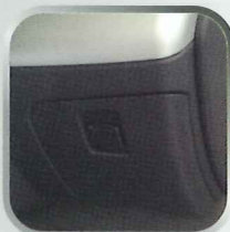
Driver side storage compartment