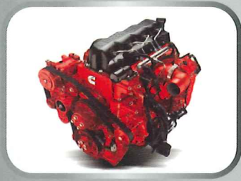
Cummins 2.8L Diesel Engine