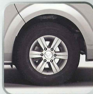
15 inches aluminium rim