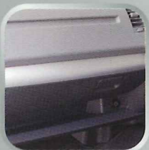
Passenger side glove box