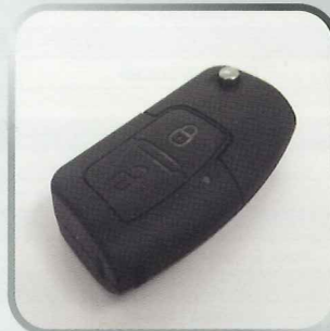
High frequency remote key