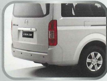
Reverse camera and reverse sensors