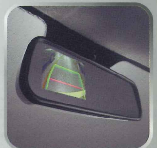
Reverse camera display