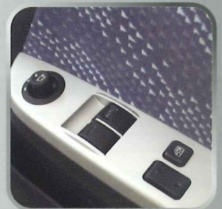
Front power window with side mirror adjustment