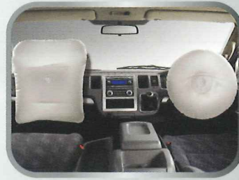
Front dual air bag