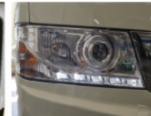
LED Daytime Running Light.