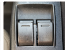
Front Driver & Passenger Power Window.