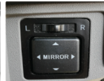
Remote Control Wing Mirror.